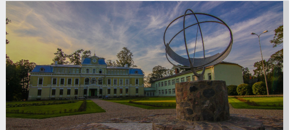
Kokmuižas saules pulkstenis