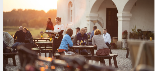
Atpūta "Valmiermuižas pils" restorānā