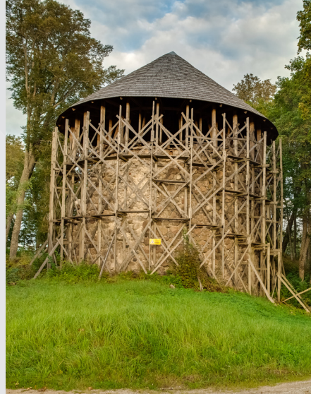
Mujānu viduslaiku pils Baltais tornis