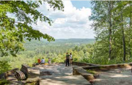
View from Mound Paradizes (Gleznotājkalns)

RĀMKALNI – SIGULDA – LĪGATNE – CĒSIS – VESELAVA – VALMIERA