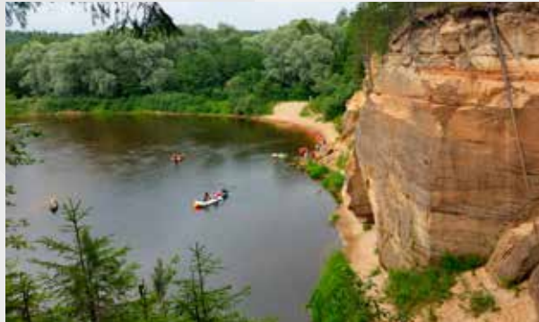
Ergļu (Erģeļu) Cliffs