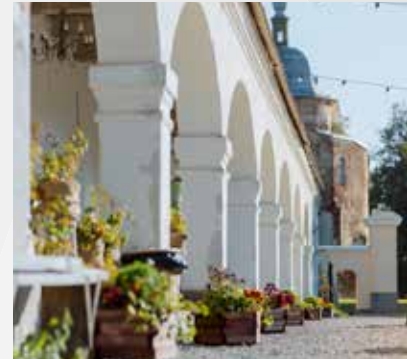
Brewery "Valmiermuižas alus" and Beer Kitchen