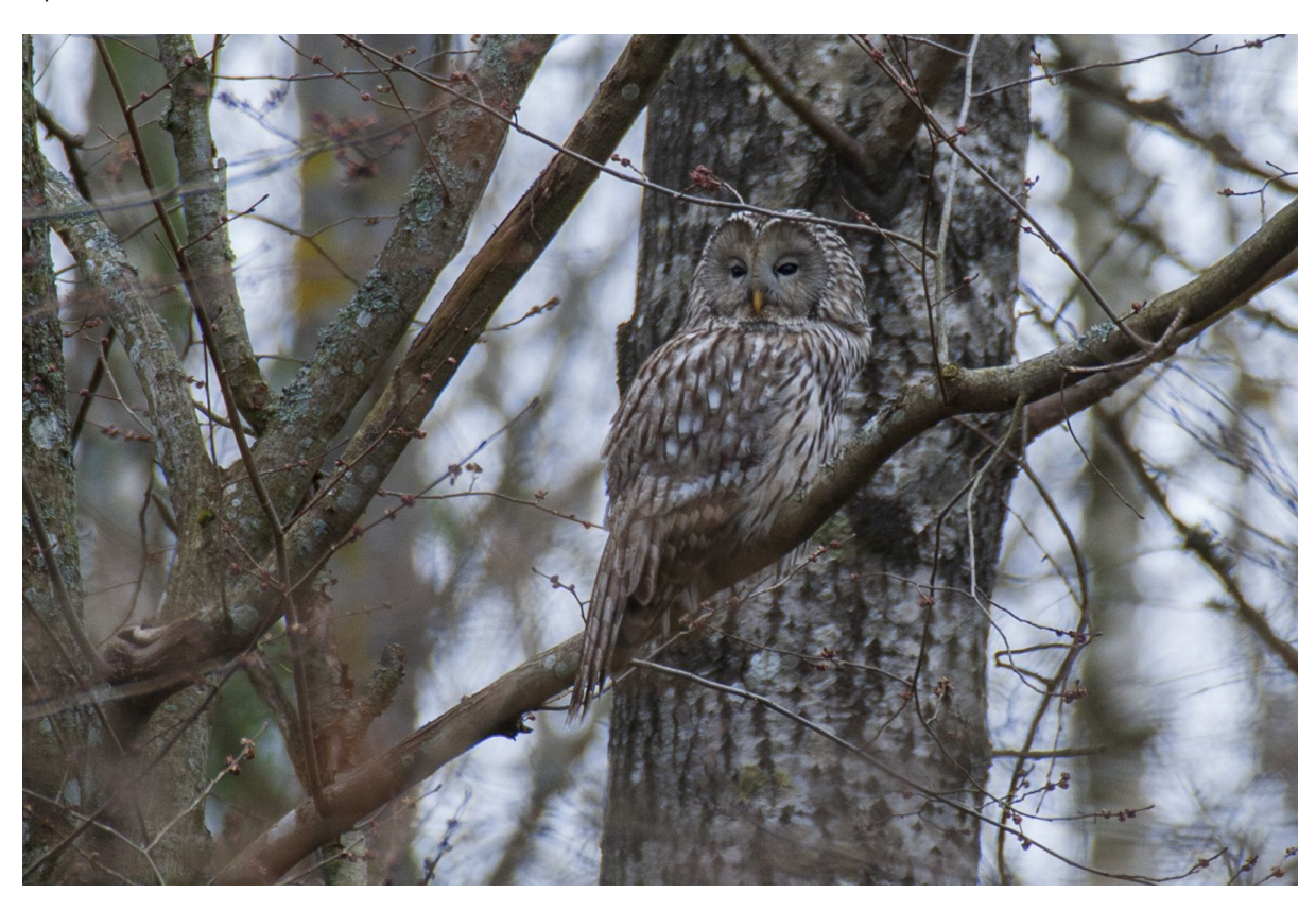
Ural owl

In addition to forest birds, species of sparrow birds uncommon in Western Europe can be found on the shores of rivers and lakes, such as the river warbler and the garden reed, the shorebirds live, and in the meadows you can still hear squeals.