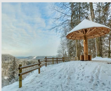
Keizarskats or Emperor's view