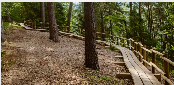
Trail in Gauja National Park

17 | Lakstīgala Ravine 57.15494, 24.84485 Deep ravine with a small brook dividing the left initial bank of the primeval valley of the River Gauja. On the southern side, there are stairs leading down to the riverside