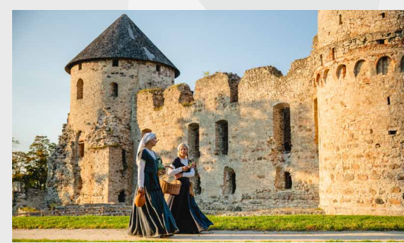
Cēsis Medieval Castle