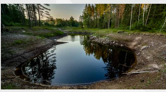
Ezernieki Karst Sinkholes

16 | Lakstīgala Ravine 57.15494, 24.84485 A deep ravine with a small brook dividing the left side of primeval valley wall of Gauja leaving Sigulda Bobsleigh and Luge Track on one side and Sigulda Hospital on the other.