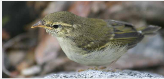
The Greenish Warbler (Phylloscopus trochiloides)