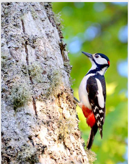
The Great Spotted Woodpacker (Dendrocopus major)