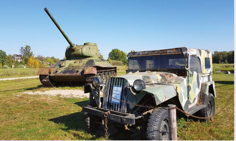
Mores kauju muzejs

The park was created in the former battle place in the Centre of More Parish where during the first two weeks of 1944 in the Second World War, major battles were held, holding the strategically created defence line and preventing the Red Army from breaking through to Riga, thus affecting the further course of history. You can see fragments of wartime relics and bunker sites here. A commemorative stone created by the sculptor