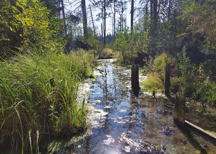
Zušu Sulphur Spring