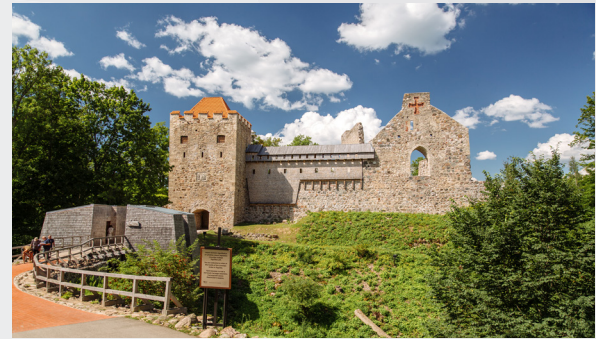
Castle of Livonian Order in Sigulda