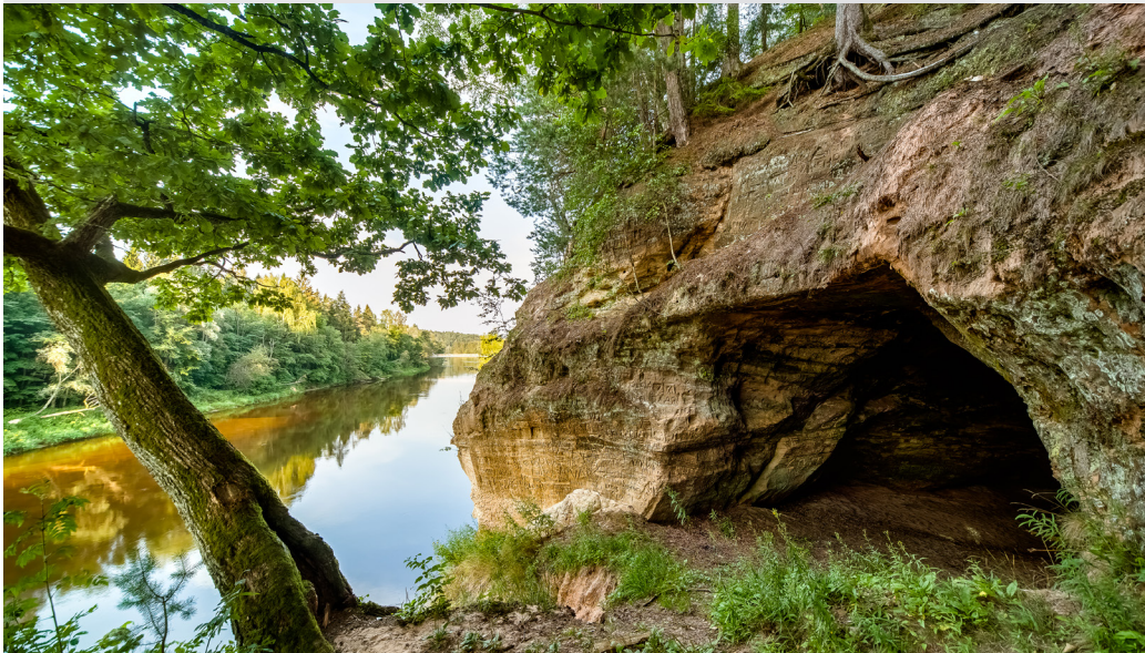
Velnala Cave in Krimulda