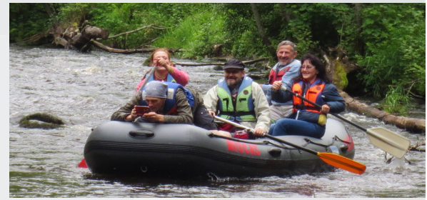
Boaters on River Brasla