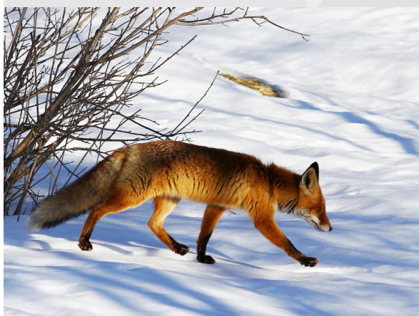
Fox ( Vulpes vulpes )