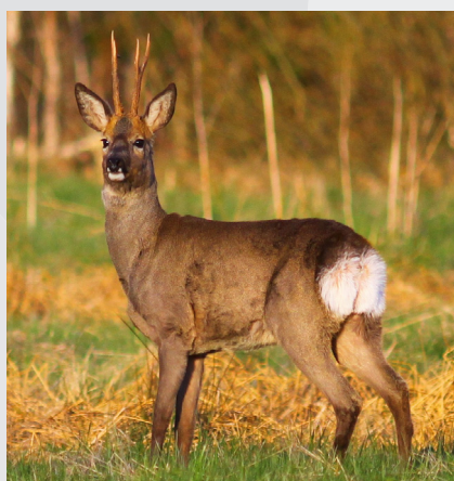
Roe Deer ( Capreolus capreolus )