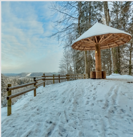
Ķeizarskats or Emperor's view