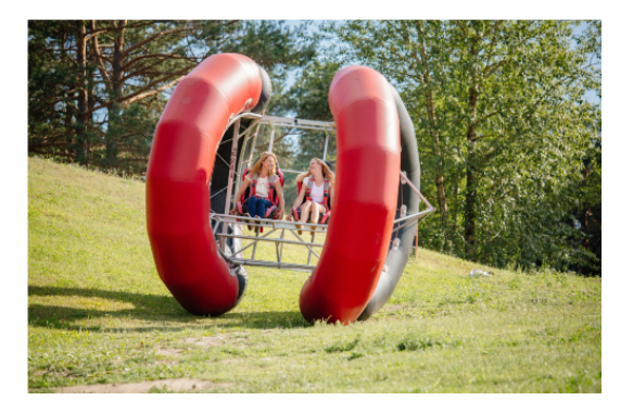
Leisure park "Rāmkalni", surrounded by beautiful nature, gathers active and courageous holidaymakers. Try different activities - in the river and even in the air!

During your visit to Valmiermuiža , you can ride a horse or pony and see the picturesque surroundings full of ancient history.