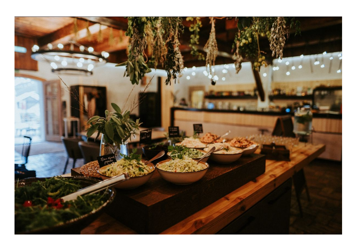
Enjoy tasty and delicious meals in local cafes, fine restaurants and local treasures of Gauja National Park.

Winter comes with new seasonal menue, surprising and sparkling details.